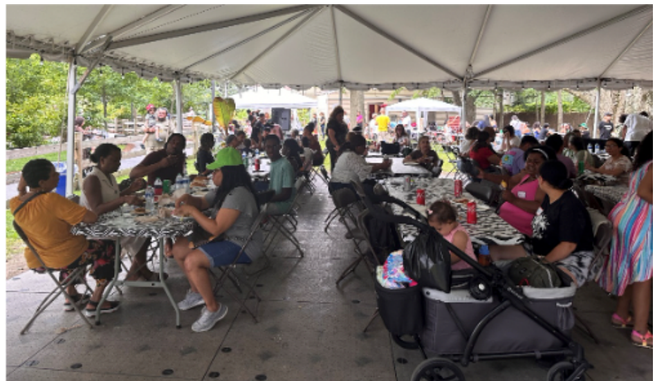
Food and Conversation

September is National Literacy Month. Get your favorite books ready!