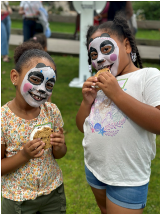
Face painting Fun

On Saturday, August 12th Nurtury, Early Education celebrated staff and their family members with a fun filled day at the Franklin Park Zoo in Boston. Families enjoyed a picnic lunch, face painting, photo booth, animal encounters, and a DJ. Families also engaged in walking around the zoo grounds to visit animal exhibits. This event was very successful and the weather collaborated with a sunny 80 degree day!